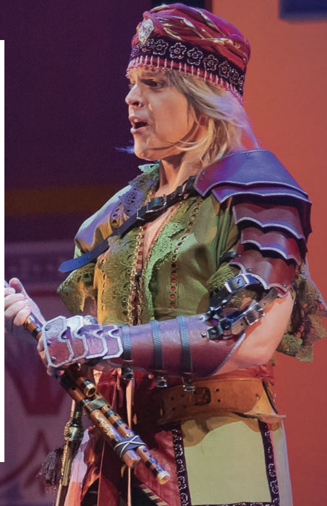
The Magic Flute | October 2022 | Steinmetz Hall

Opera Orlando settled into its new home, Steinmetz Hall, in the 2022-23 season, producing all three MainStage shows in the acoustically-ideal space at Dr. Phillips Center for the Performing Arts. Its Opera Everlasting season opened with a Mozart masterpiece, The Magic Flute , then in December a touring production of All Is Calm: the Christmas Truce of 1914 , which finished its run on the MainStage. The Opera went On the Town in March with Bella Notte at Bella Collina , a one-night-only double bill of The Marriage Contract and Gianni Schicchi at the idyllic Tuscan-inspired property, Bella Collina. The Company then returned to Steinmetz Hall with Donizetti's hilarious The Daughter of the Regiment , which was originally slated for the 2019-20 season but was cancelled due to COVID-19. The season concluded with the Florida premiere and second only production of Baseball: a Musical Love Letter at Harriett's Orlando Ballet Centre. The Company continued to make significant investments in shop materials, supplies, sets, and costume rentals, greatly expanding the build capability and capacity of the shared shop with the Orlando Ballet. It also continued its production partnerships with MicheLee Puppets, the Orlando Philharmonic Orchestra, and the Orlando Ballet.