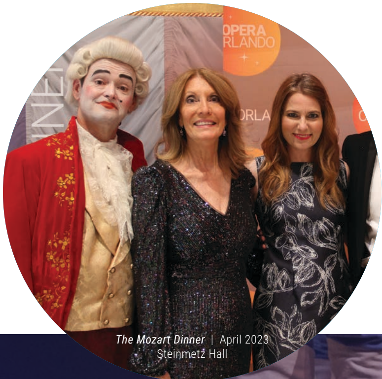
The Mozart Dinner | April 2023 Steinmetz Hall